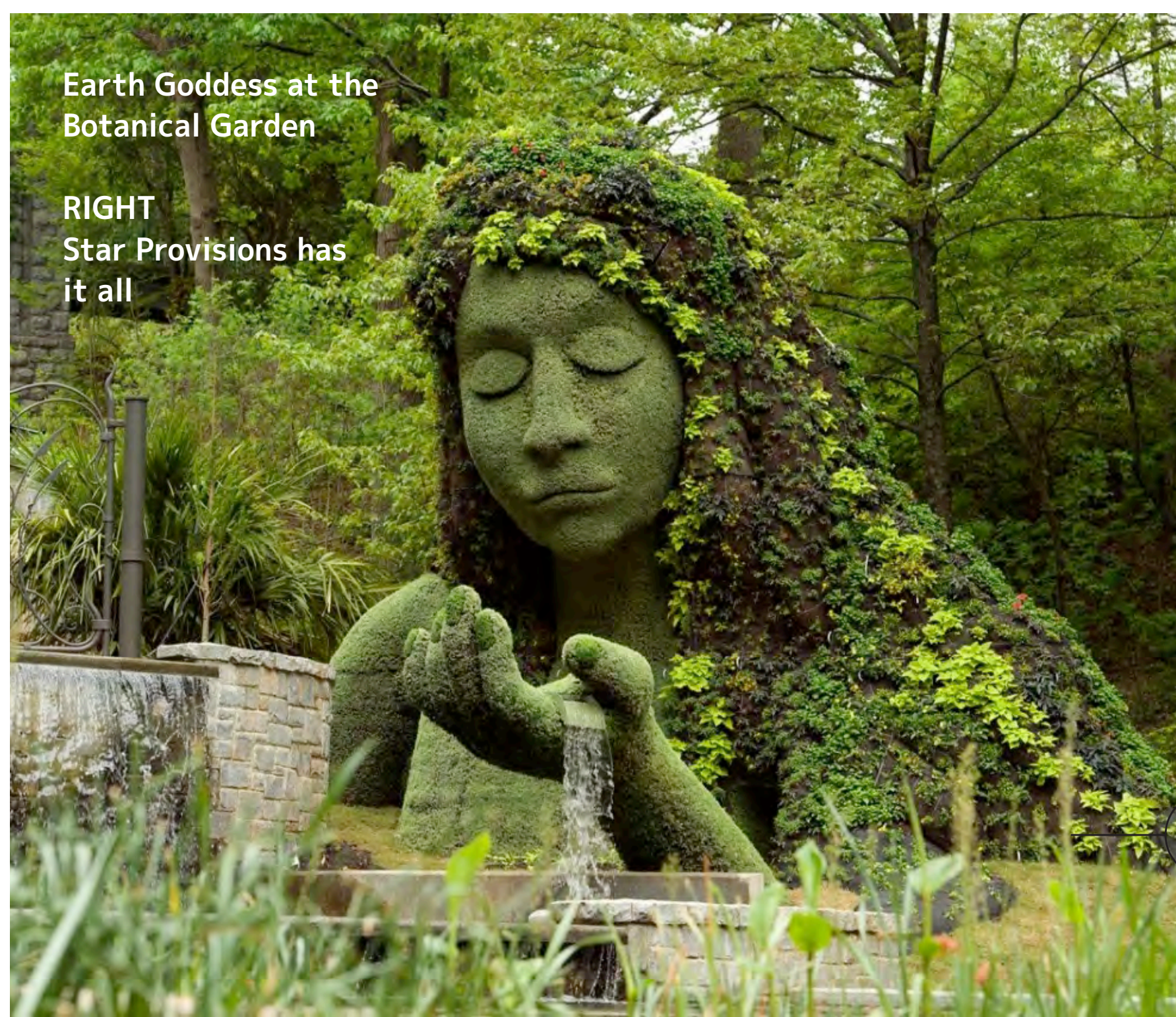
Earth Goddess at the Botanical Garden

Dream Cars INNOVATIVE DESIGN - VISIONARY IDEAS ... [We] dream of cars that will float and fly, or run on energy from a laser beam, or travel close to the ground without wheels. Such research may border on the fantastic, but so did the idea of a carriage going about the country without a horse. —The Ford Book of Styling, 1963