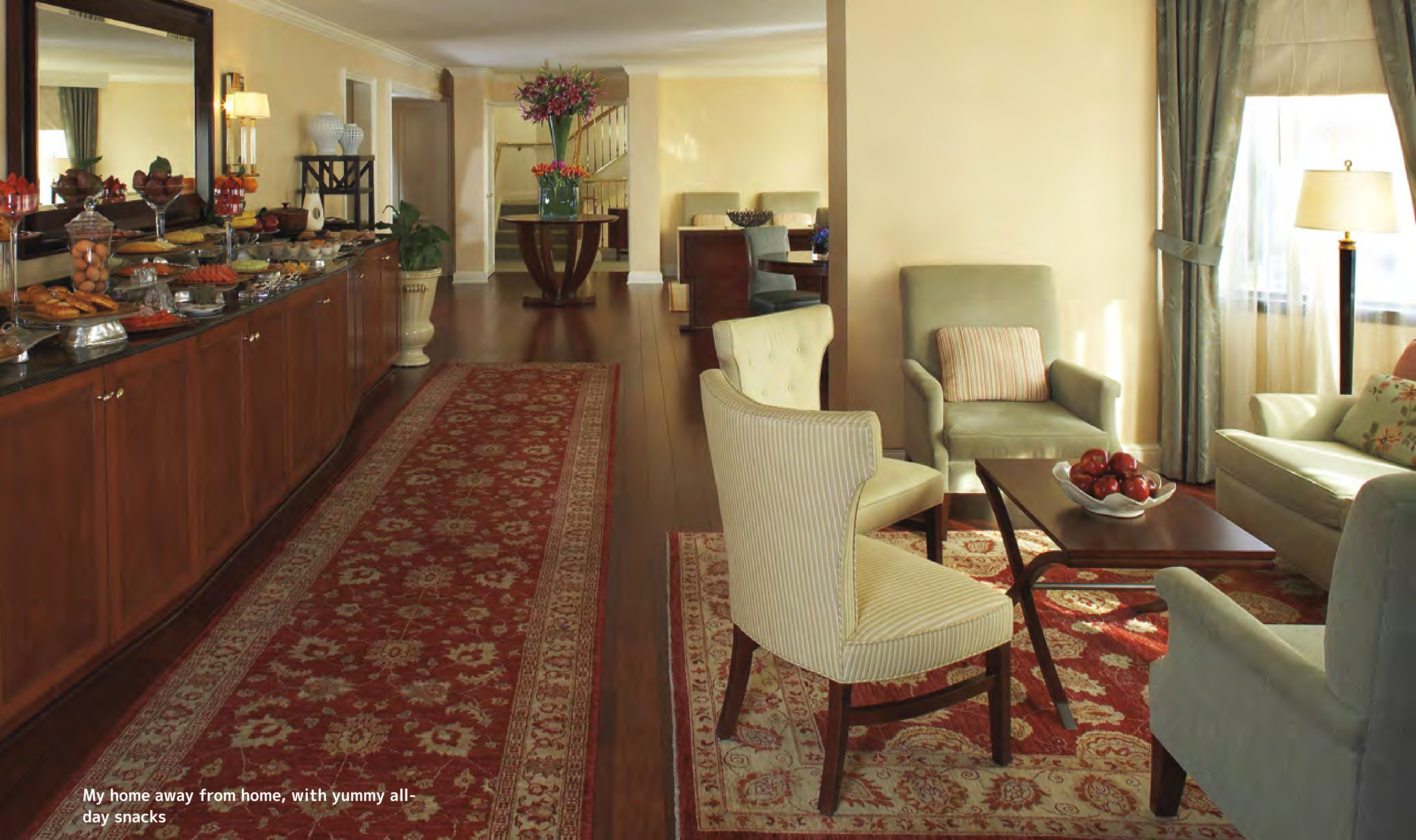
My home away from home, with yummy all-day snacks