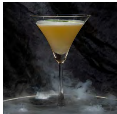
RIGHT The Sky Cocktail

The Sky Cocktail is featured in the new Elements Cocktail Series. The drink will be served at Sky Bar atop the Tower Club at lebua for New Year's Eve.