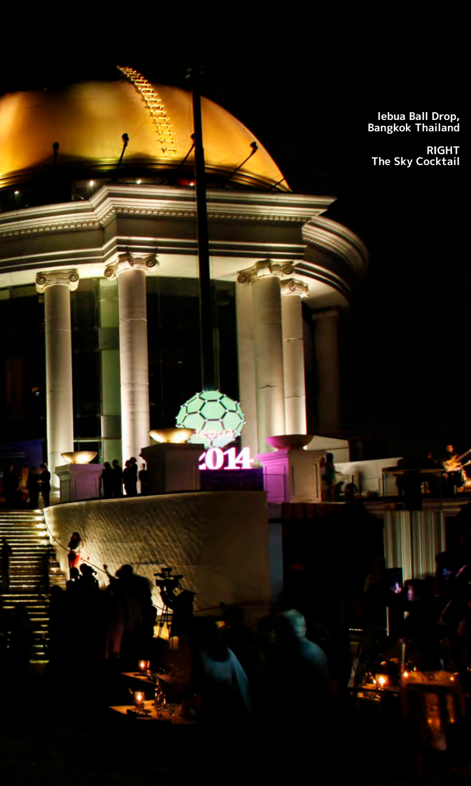
lebua Ball Drop, Bangkok Thailand