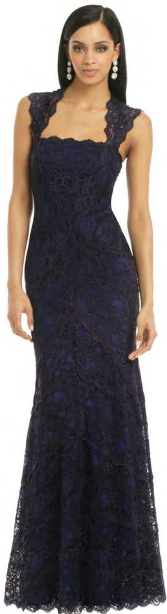
Lady in Waiting Gown by Nicole Miller

Kleiner Perkins, Bain Capital Ventures, Highland Capital, American Express, Advance Publications (Condé Nast) and Novel TMT ventures. The company has raised approximately $54 million to date in VC funding.