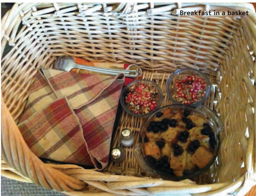
Breakfast in a basket

dozens of beautiful waterfalls in the area, the Lower Lewis River Falls. It's quite hidden away so don't give up as you wind through the woods to find it as you will be happy you took the time.