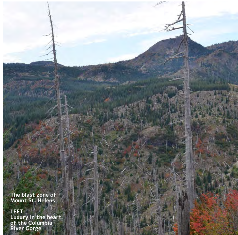
The blast zone of Mount St. Helens