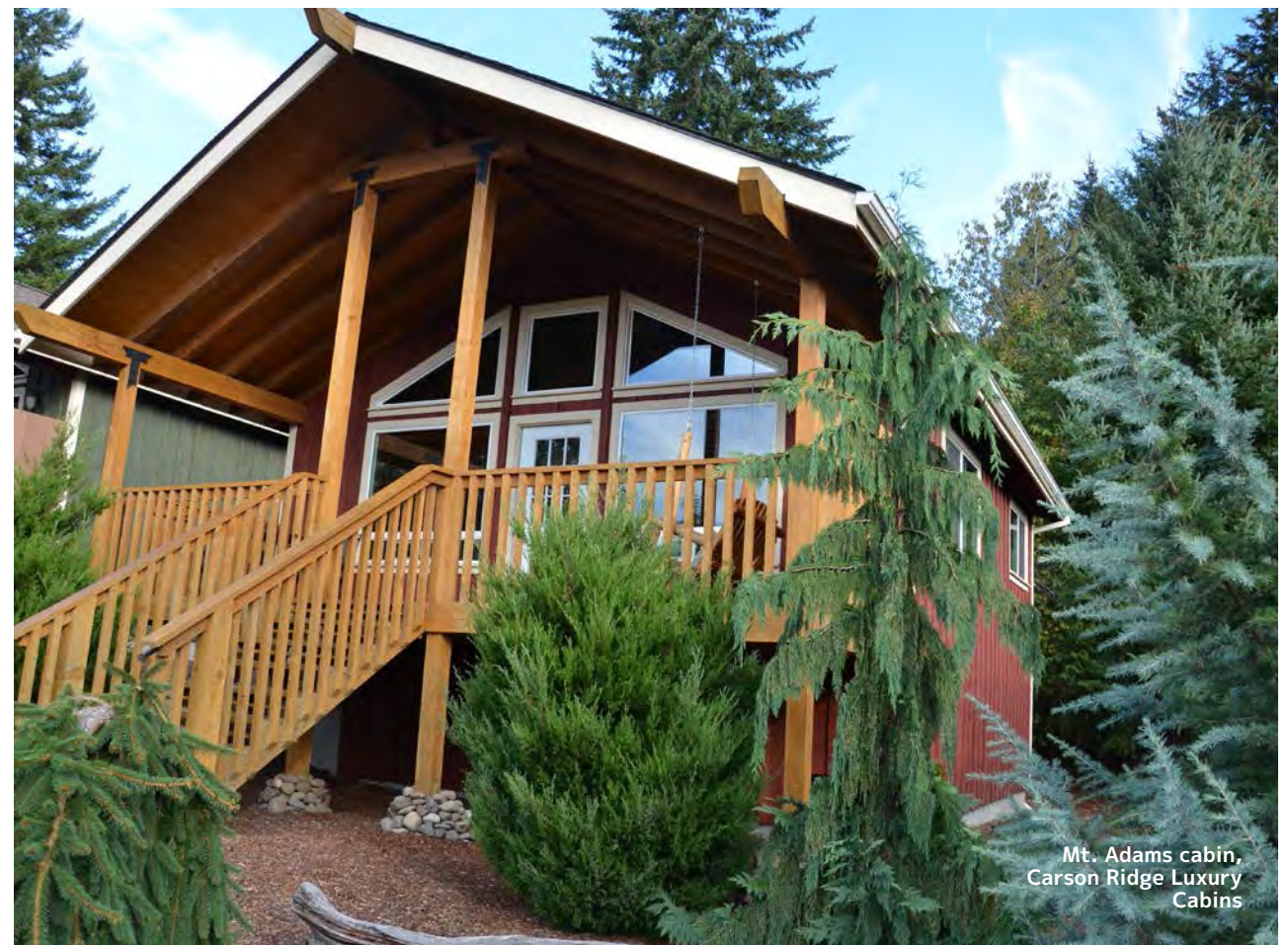
Mt. Adams cabin, Carson Ridge Luxury Cabins