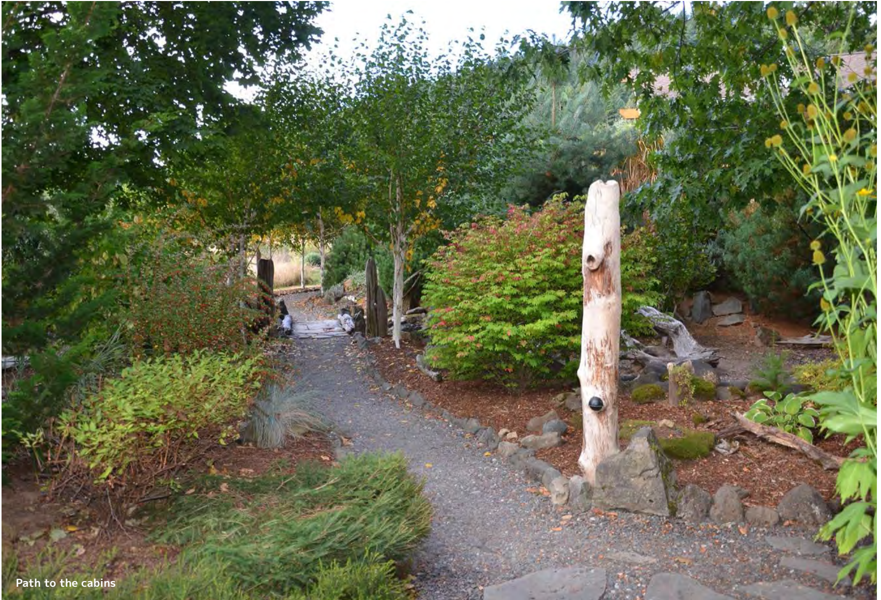
Path to the cabins

basket. That's right. Our breakfast was delivered right to our door.