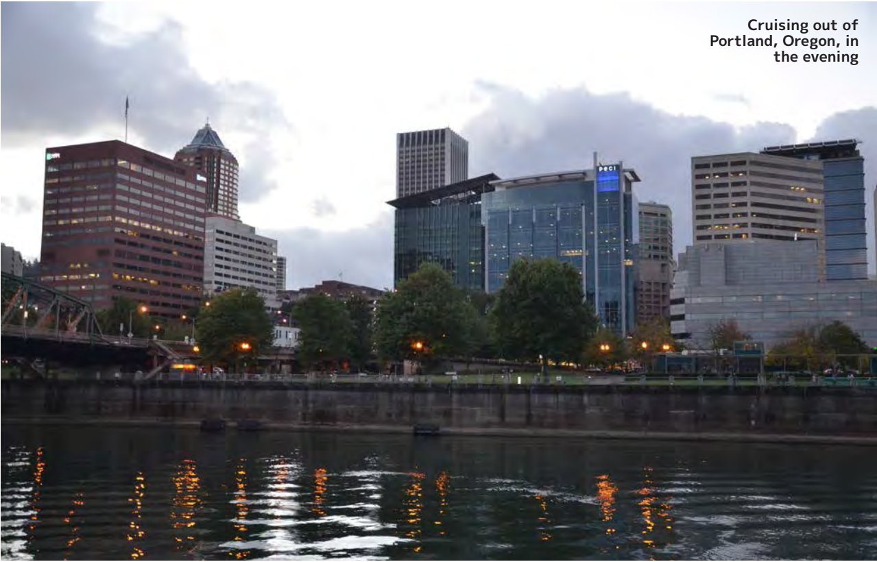
Cruising out of Portland, Oregon, in the evening