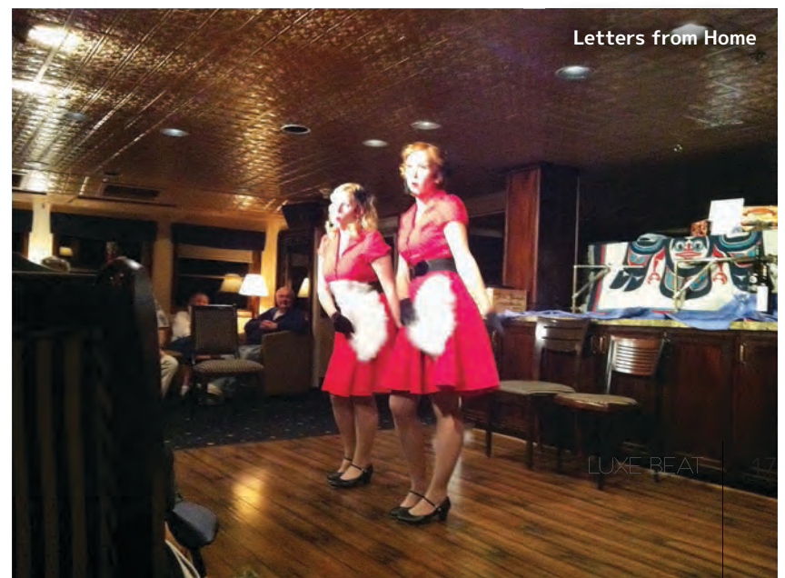
Letters from Home

There are a lot of advantages to small ship cruising: smaller number of passengers, ability to navigate into interesting locations and a comfortable, relaxed atmosphere. But possibly the best thing about cruising on a small ship on rivers is that there is no danger of seasickness! After exploring the