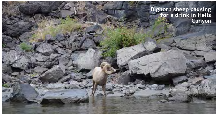
Bighorn sheep pausing for a drink in Hells Canyon