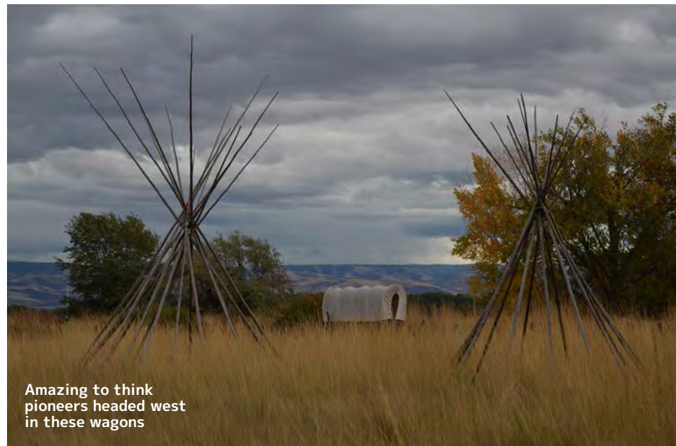
Amazing to think pioneers headed west in these wagons

(one of many locks on our cruise) and our first shore excursion was a tour of the huge turbines and fish ladders at the dam's Visitor Center. Lewis and Clark must have been amazed at the beauty of this place although I'm sure it was much easier in some ways for them to traverse the river without all the dams and locks which exist today.