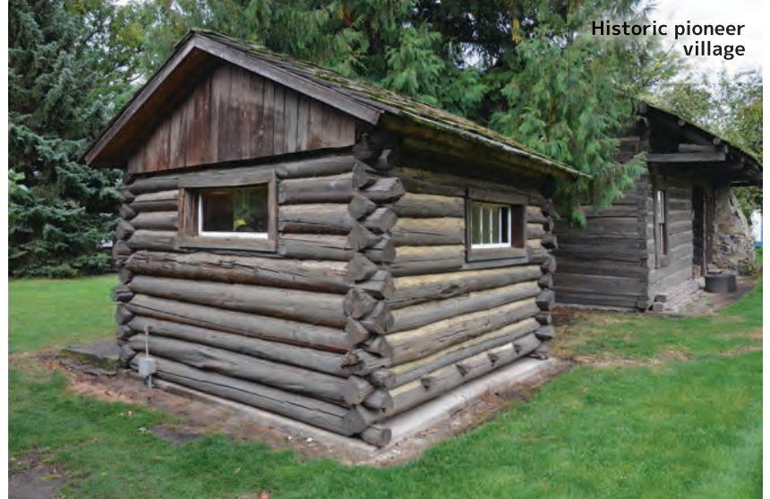
Historic pioneer village