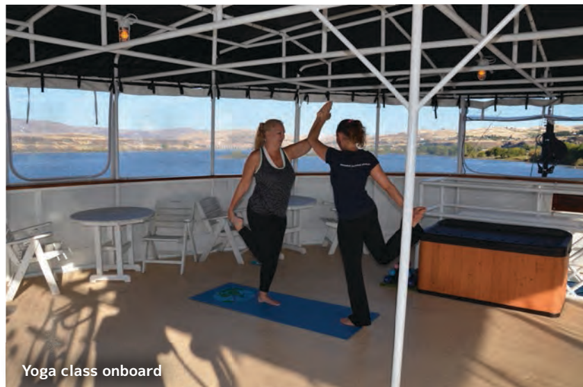
Yoga class onboard