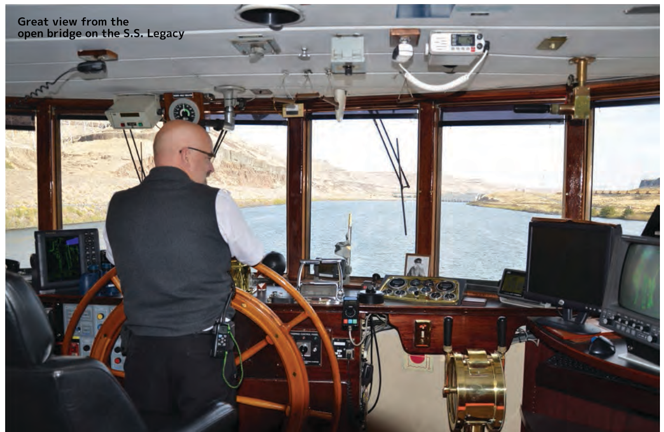
Great view from the open bridge on the S.S. Legacy

just for fun. The cruise leaves from Portland, Oregon, and we boarded the ship with no idea of the wonderful experience we were about to have.