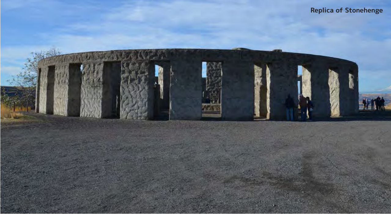
Replica of Stonehenge

One of our best days took place on our jet boat cruise of Hells Canyon. After docking in Clarkston and learning about the historical significance of the Nez Perce people and the Lewis and Clark Expedition's encounter with these Native Americans, we clambered aboard a covered jet boat for an exciting ride into the canyon. This section of the Snake River was lined with beautiful yet rustic cabins – very rustic, as they have no plumbing or electricity!