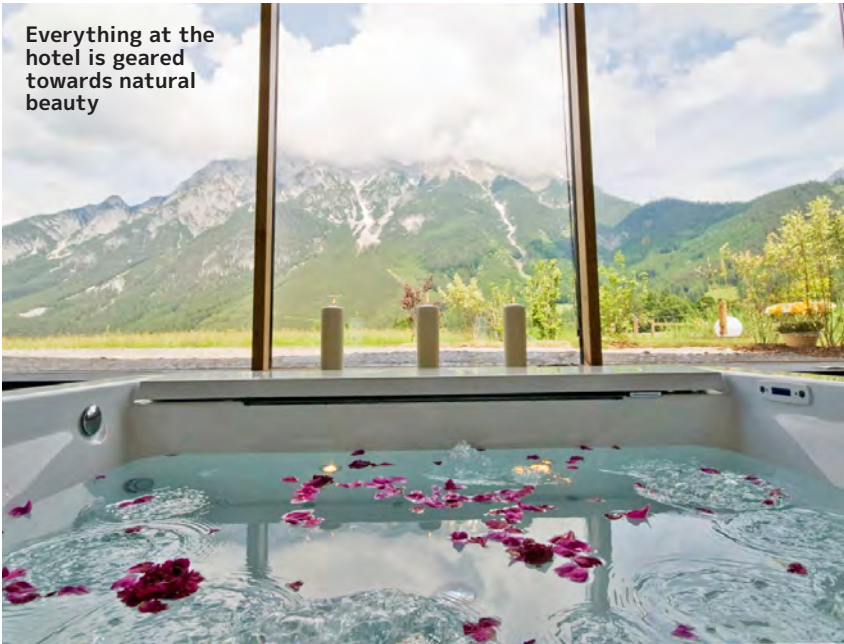
Everything at the hotel is geared towards natural beauty