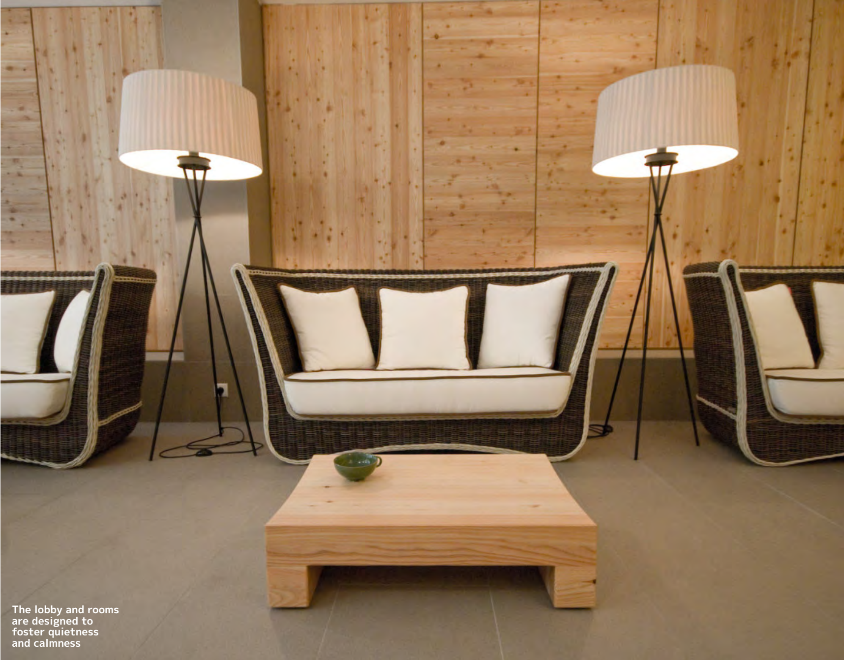
The lobby and rooms are designed to foster quietness and calmness