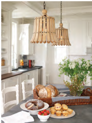
Wake up to beautiful breakfasts served by our lighthouse keepers in the cozy kitchen with fireplace and ocean vistas.