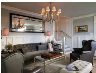
Our living quarters are outfitted with the latest modern technology including wifi, LED televisions, and USB ports.