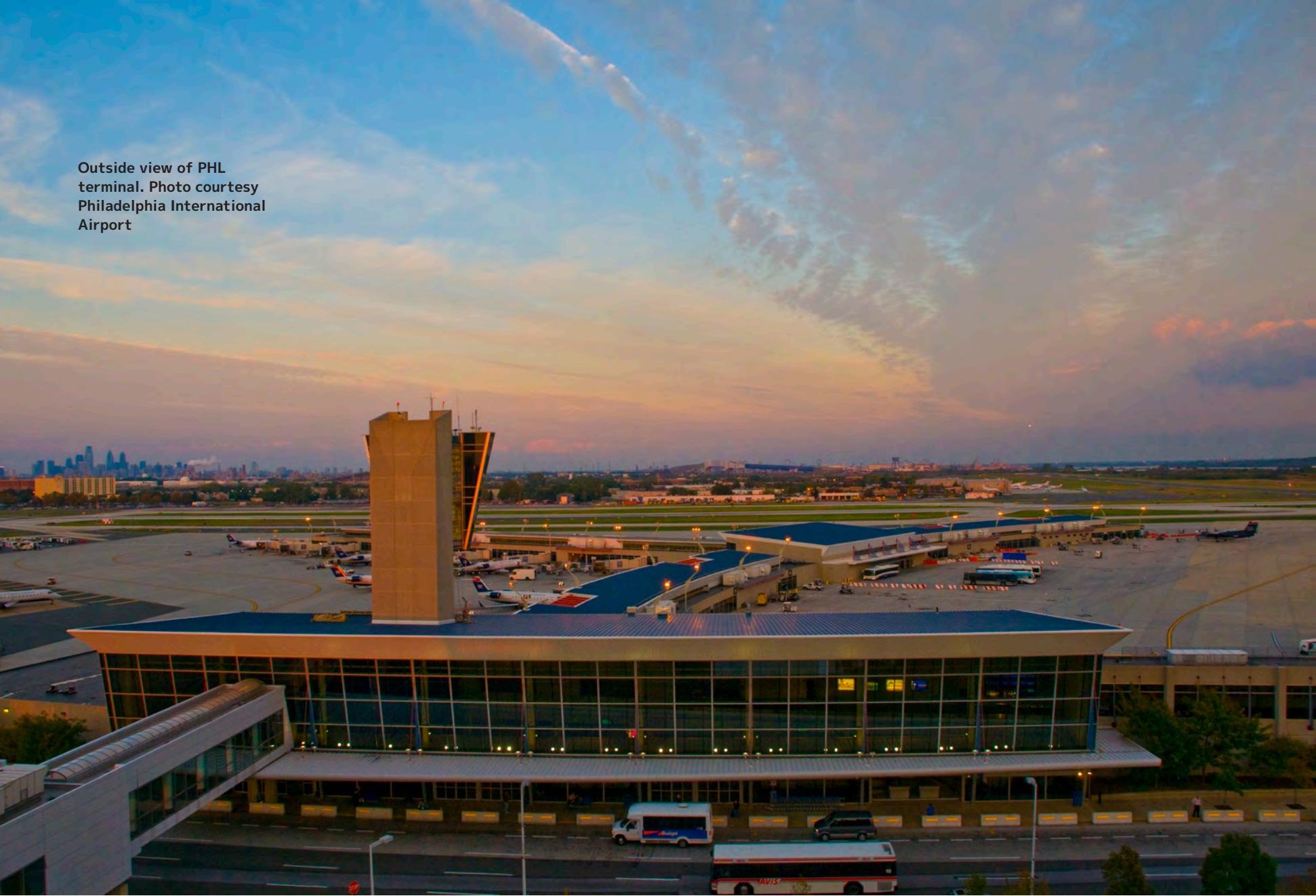
Outside view of PHL terminal.

is open from 7am to 8pm; the spa near Gate F25 is open 7am to 10pm.