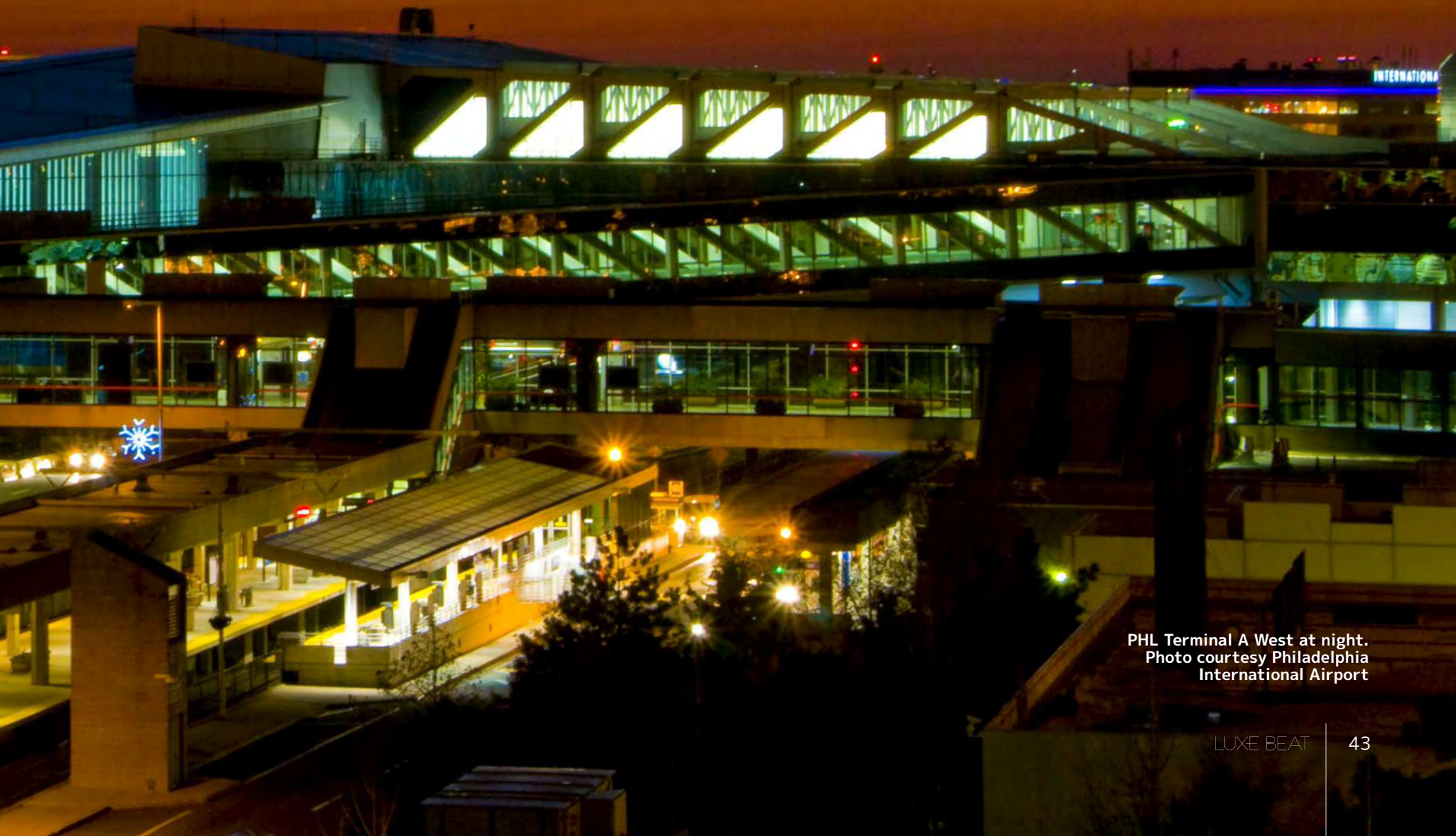
PHL Terminal A West at night.