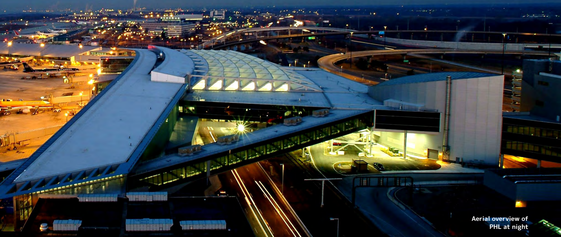
Aerial overview of PHL at night

Club also offer meals for purchase and premium alcohol for purchase in addition to the complimentary snacks and house liquors.