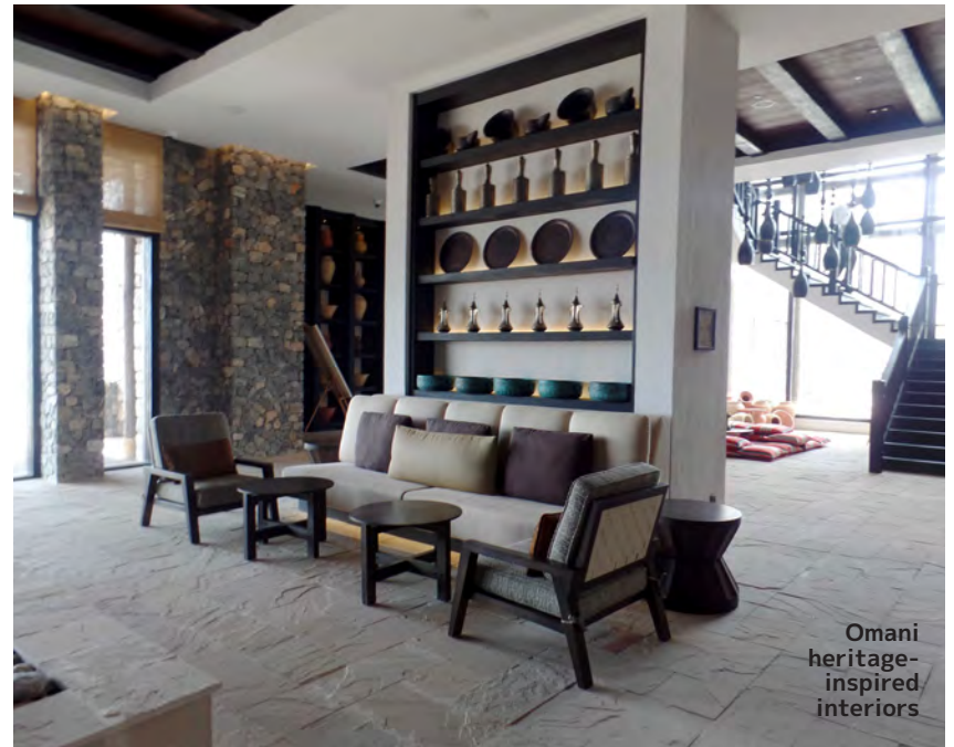
Omani heritage-inspired interiors