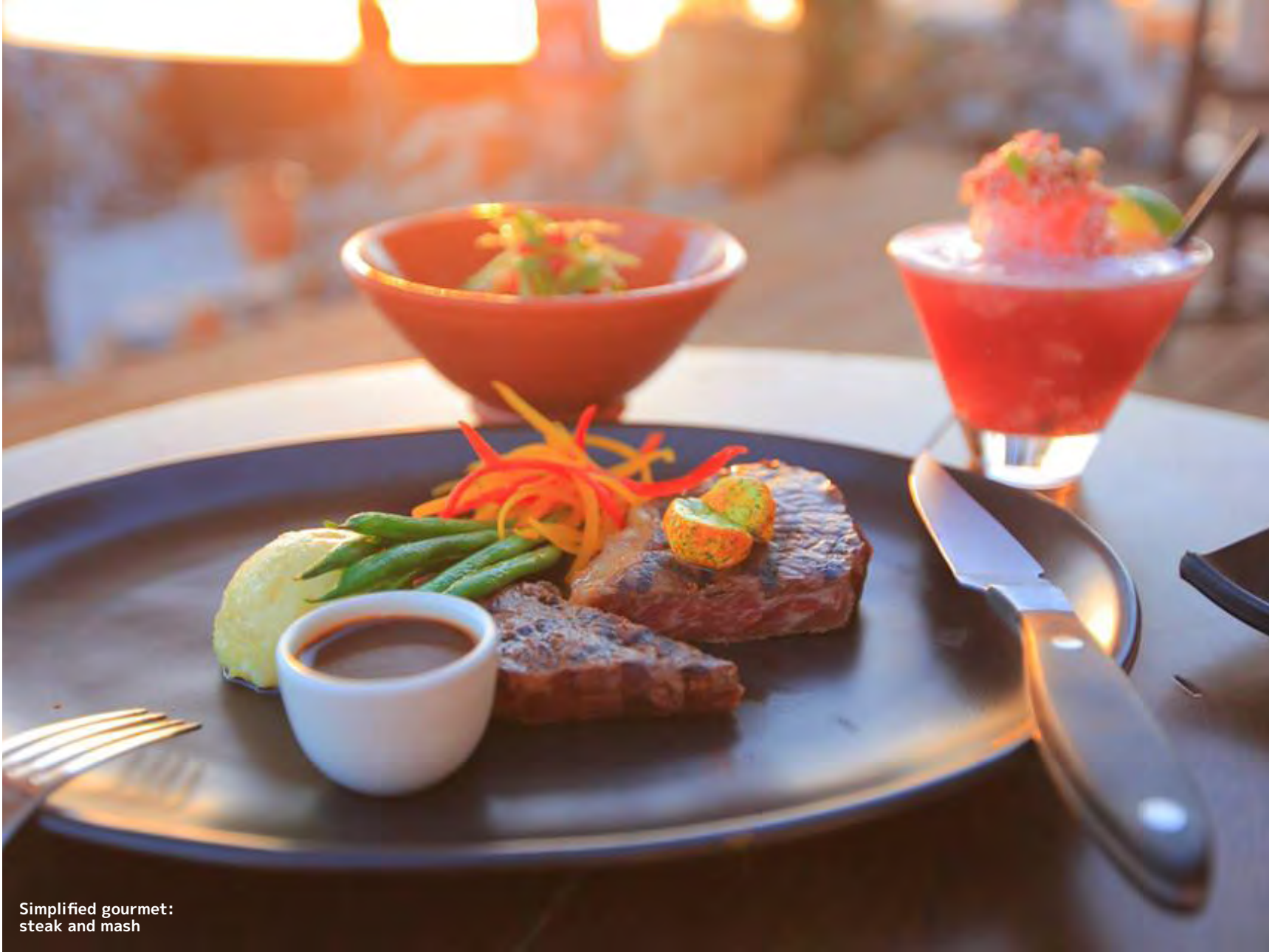
Simplified gourmet: steak and mash