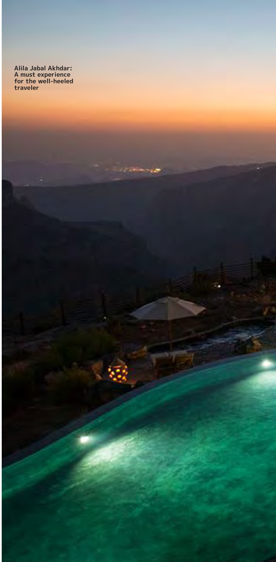
Alila Jabal Akhdar: A must experience for the well-heeled traveler

I went. The spa produces their own Balinese-inspired, community-driven Alila Living products with recipes featuring the curative benefits of fresh, natural, quality ingredients.