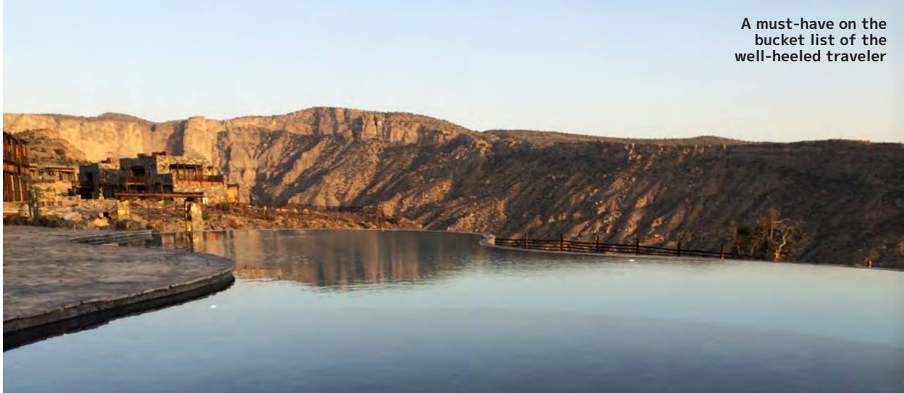
A must-have on the bucket list of the well-heeled traveler