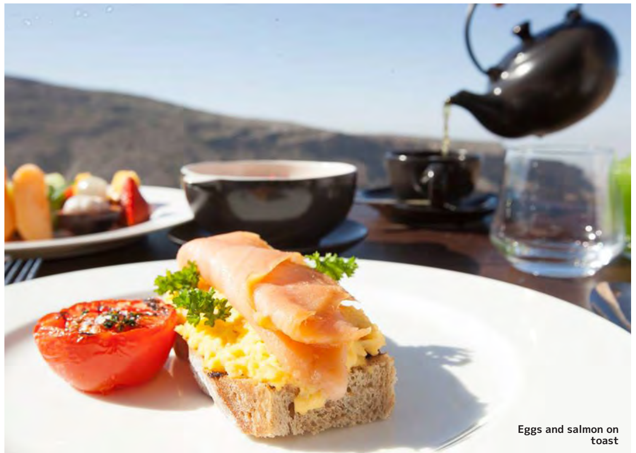
Eggs and salmon on toast

Alila Jebel Akhdar is a haven to bring your mind, body and soul in alignment. From the experiences, dining, and nature around, you begin your transition to healing. For the body, Spa Alila offers top notch spa service led by the passionate and