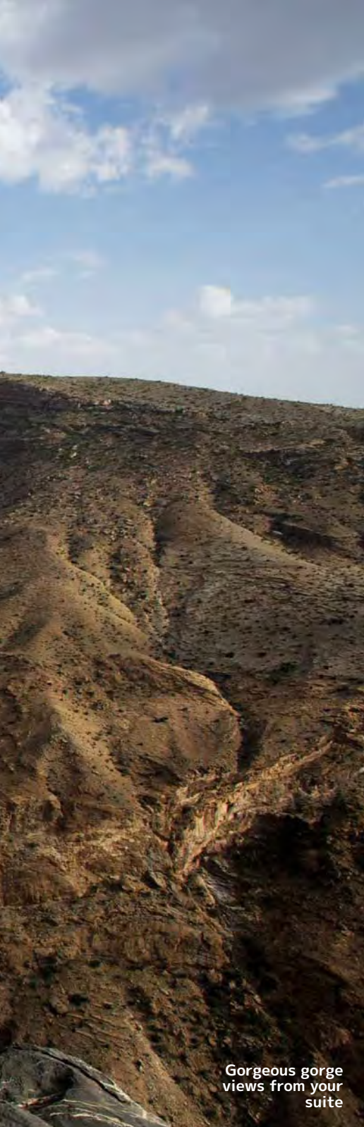
Gorgeous gorge views from your suite

the property mirroring Oman’s traditional aflaj system of irrigation channels that dates back 2,000 years and is still used to water the areas date farms and other agriculture.