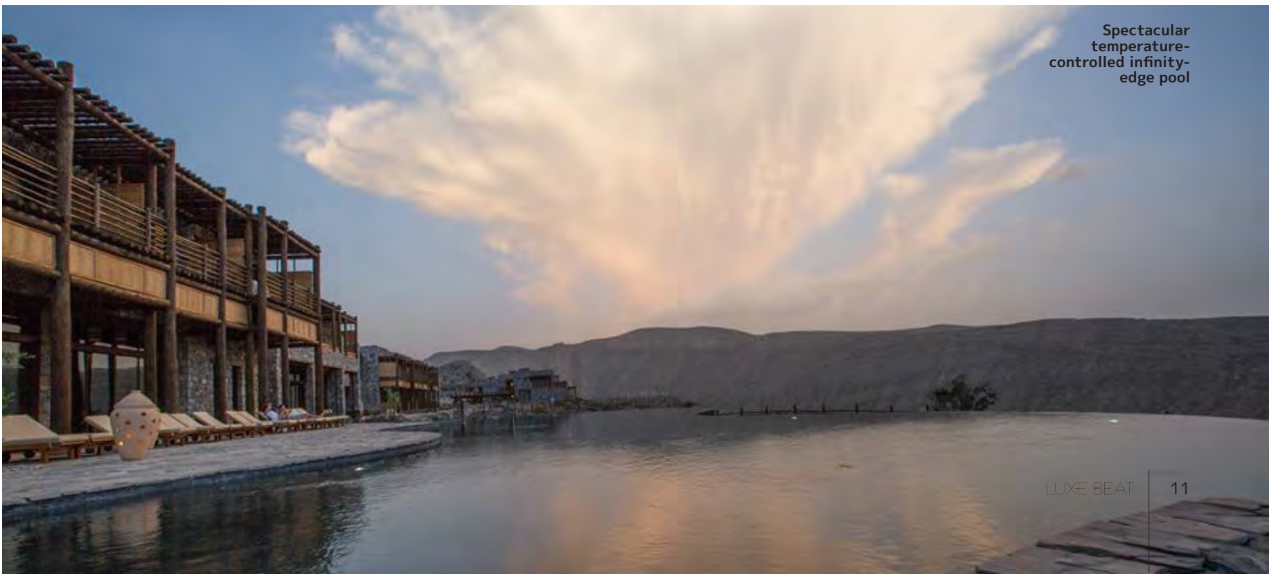
Spectacular temperature-controlled infinity-edge pool