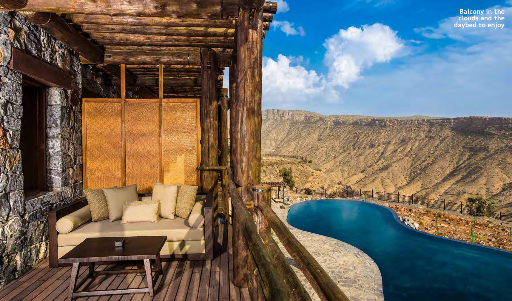
Balcony in the clouds and the daybed to enjoy