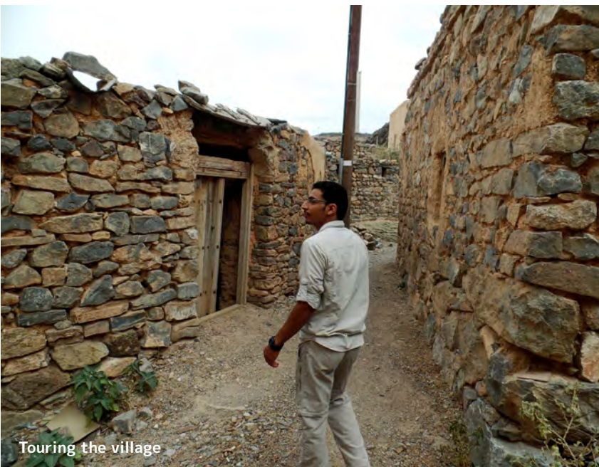
Touring the village