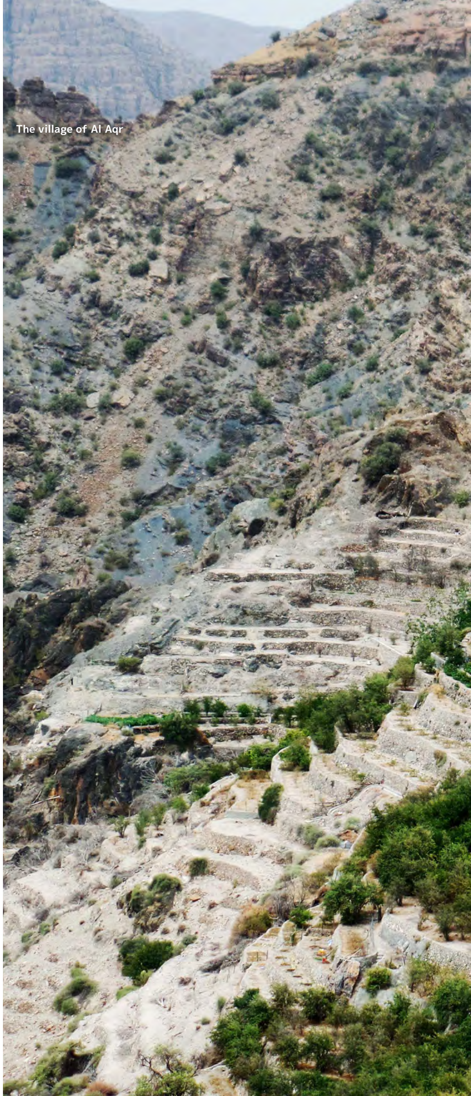
The village of Al Aqr