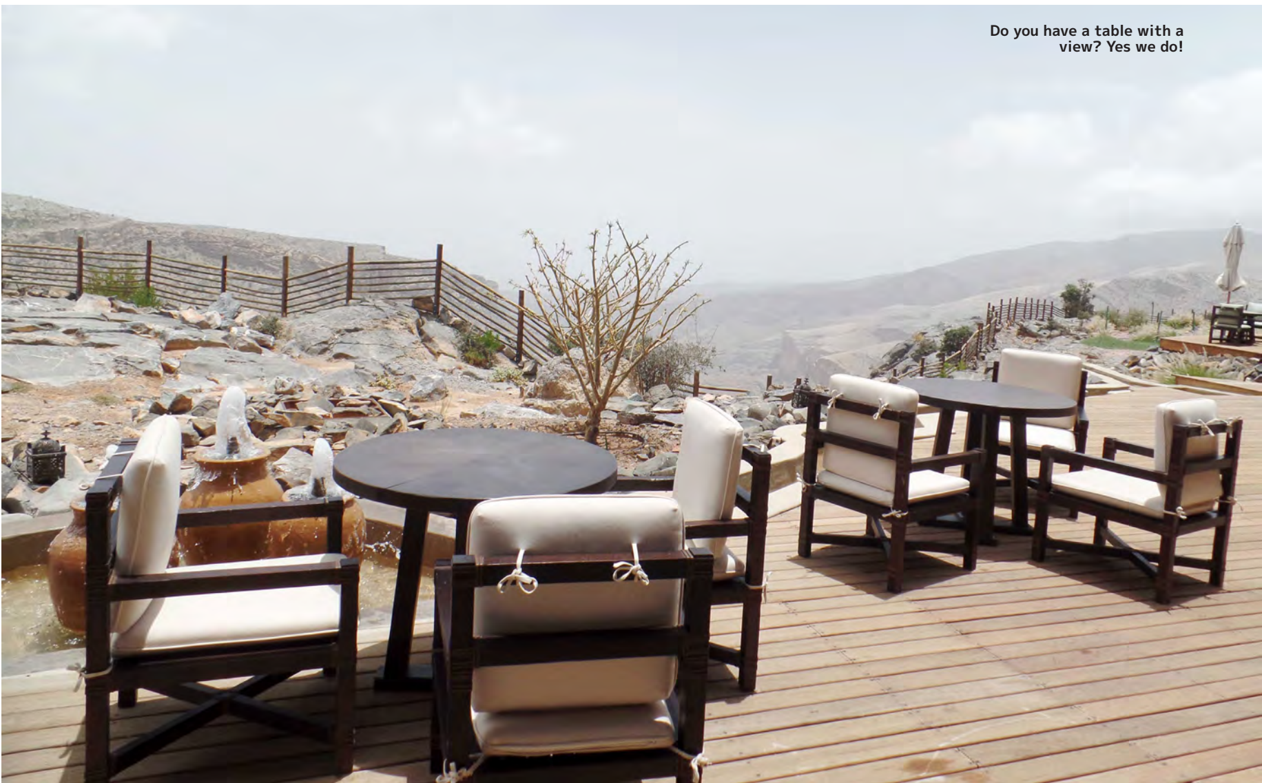
Do you have a table with a view? Yes we do!