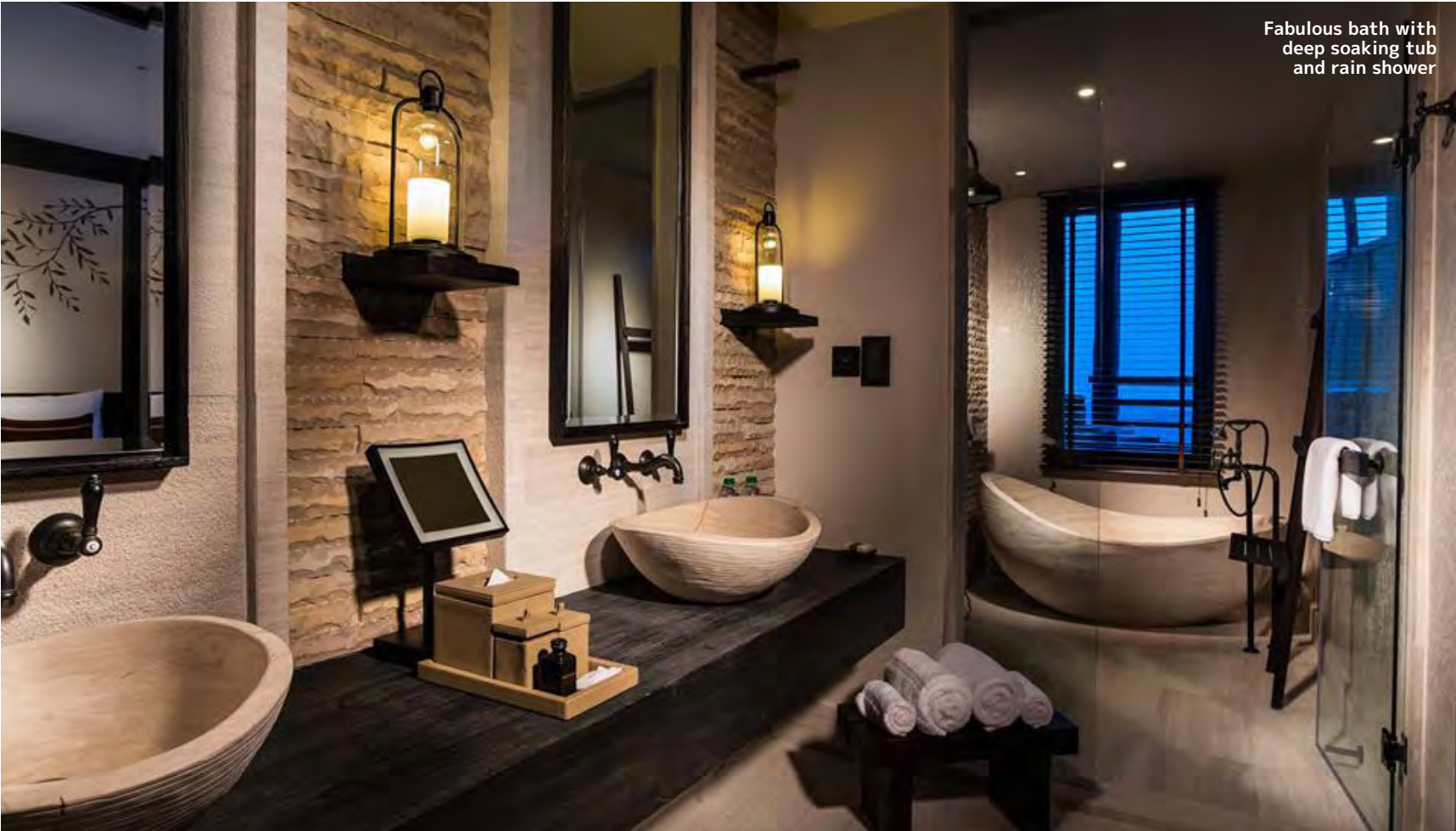
Fabulous bath with deep soaking tub and rain shower