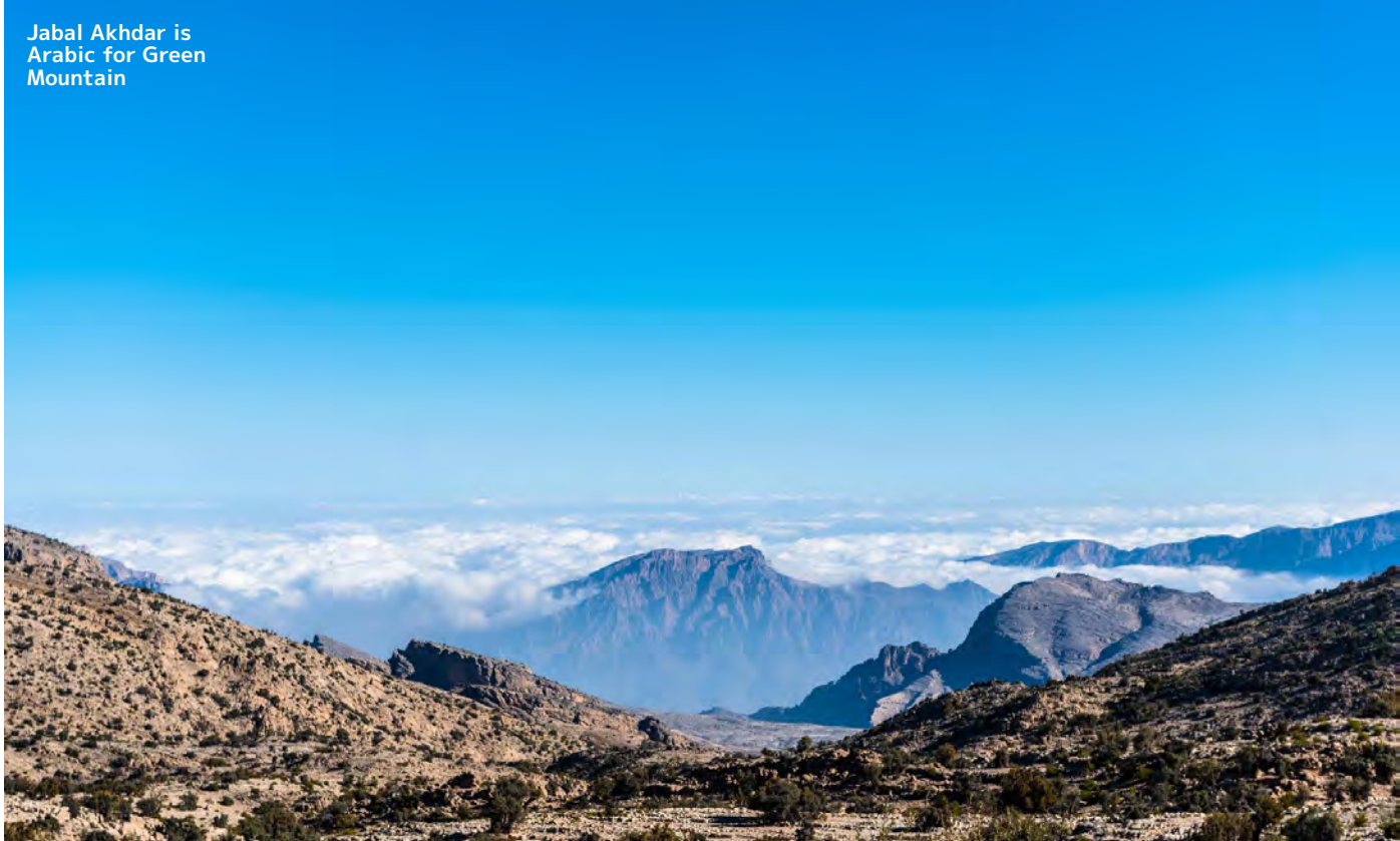
Jabal Akhdar is Arabic for Green Mountain