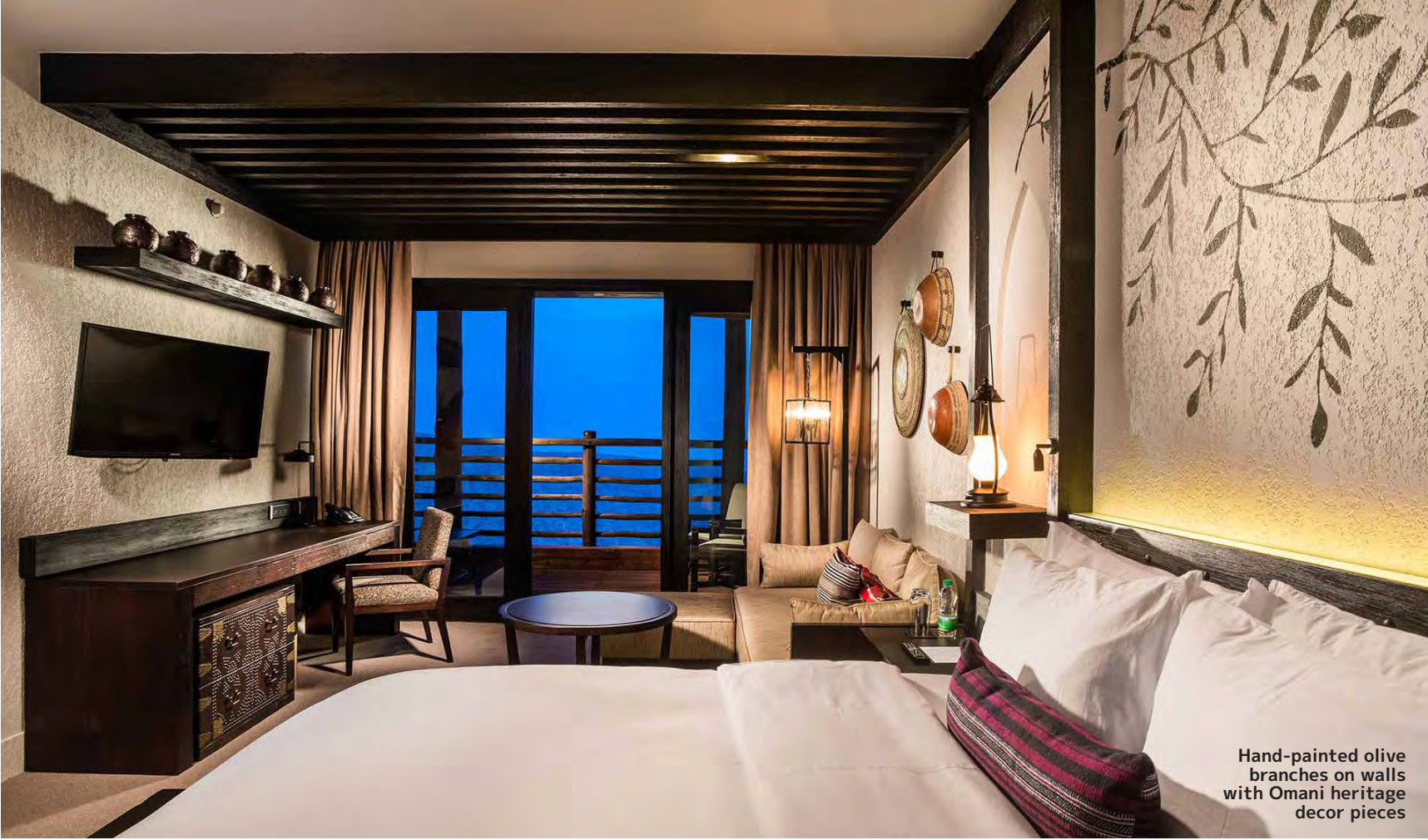
Hand-painted olive branches on walls with Omani heritage decor pieces