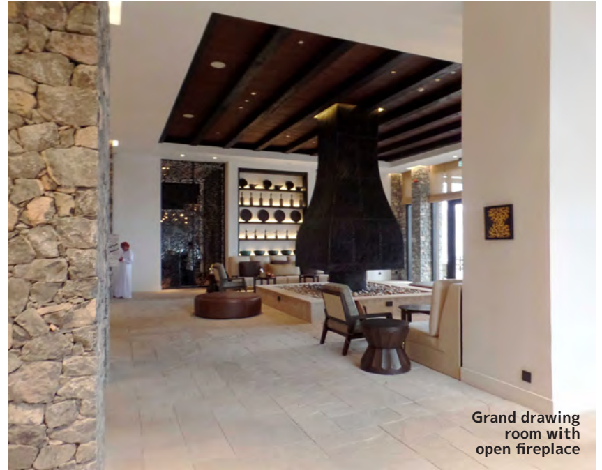
Grand drawing room with open fireplace

The cuisine could be defined as uncomplicated gourmet: just the top