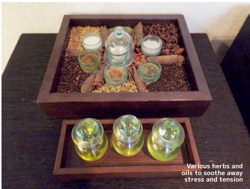
Various herbs and oils to soothe away stress and tension