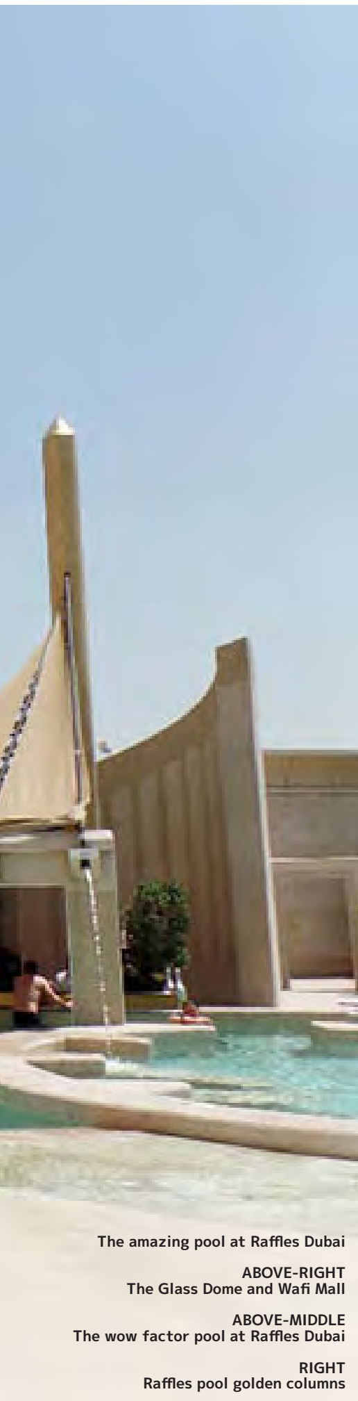
The amazing pool at Raffles Dubai