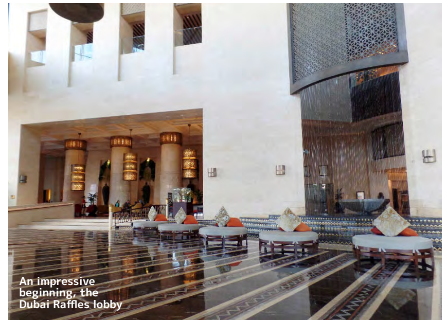
An impressive beginning, the Dubai Raffles lobby