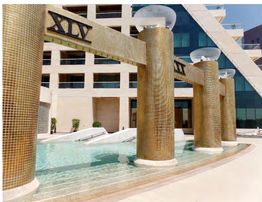
RIGHT Raffles pool golden columns

Dubai is an amazing city with so much to see and do. In the center of it all, near to the beaches and top shopping malls, is the area known as WAFI where you'll find an icon of architecture and hospitality, the Raffles Dubai.