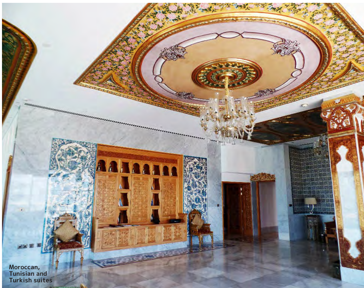
Moroccan, Tunisian and Turkish suites

For those looking to spread out even more, there are various suites designed for those who want to “live large.” These are themed for various countries, from Morocco to Turkey. Truly amazing rooms fit for a sultan with ornate décor, large dining areas, entertainment spaces and wrap-around balconies overlooking the Dubai skyline.