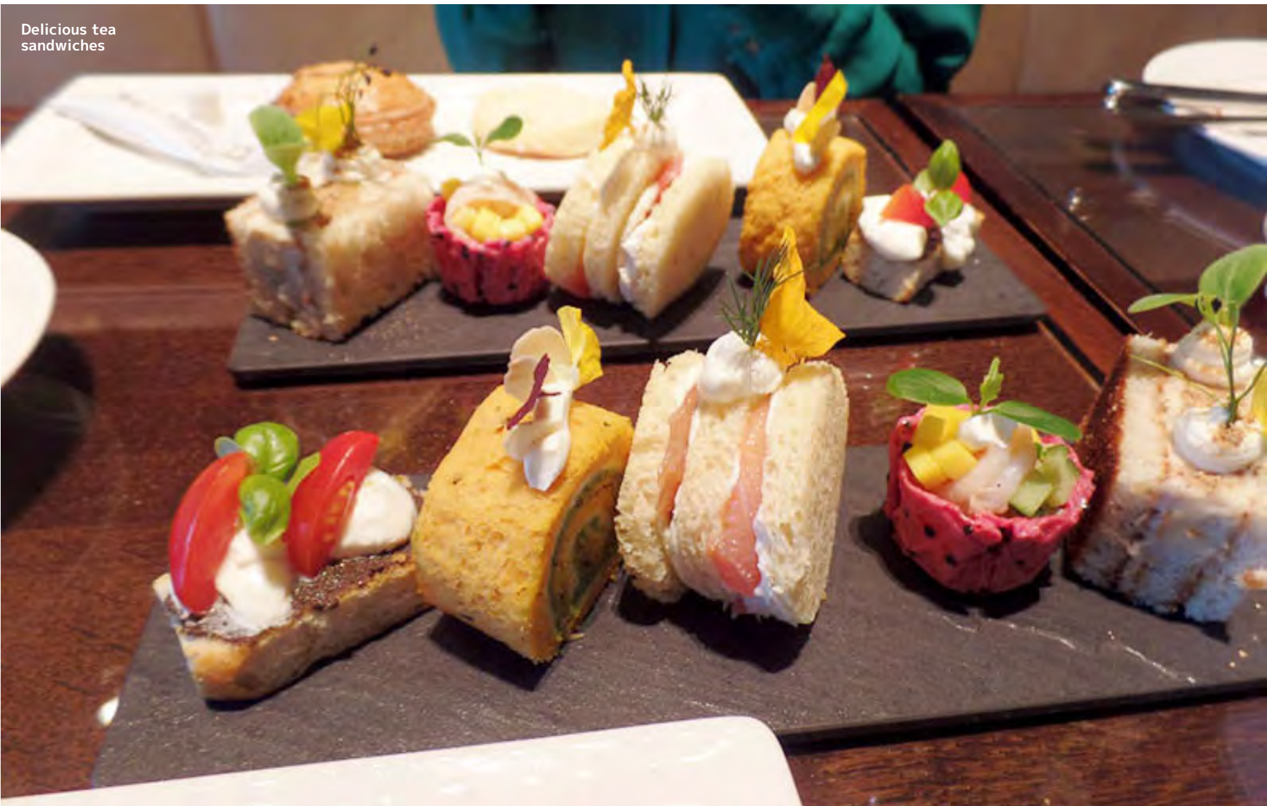
Delicious tea sandwiches

The Raffles Dubai is impressive from start to finish. Fantastic location, services that set a new standard and accommodations and amenities with every bell and whistle. For those looking for a great place to enjoy Dubai, the Raffles Dubai is a magnificent choice.