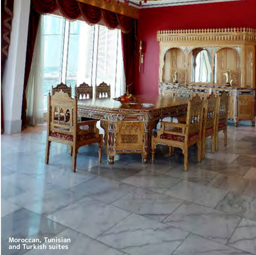
Moroccan, Tunisian and Turkish suites