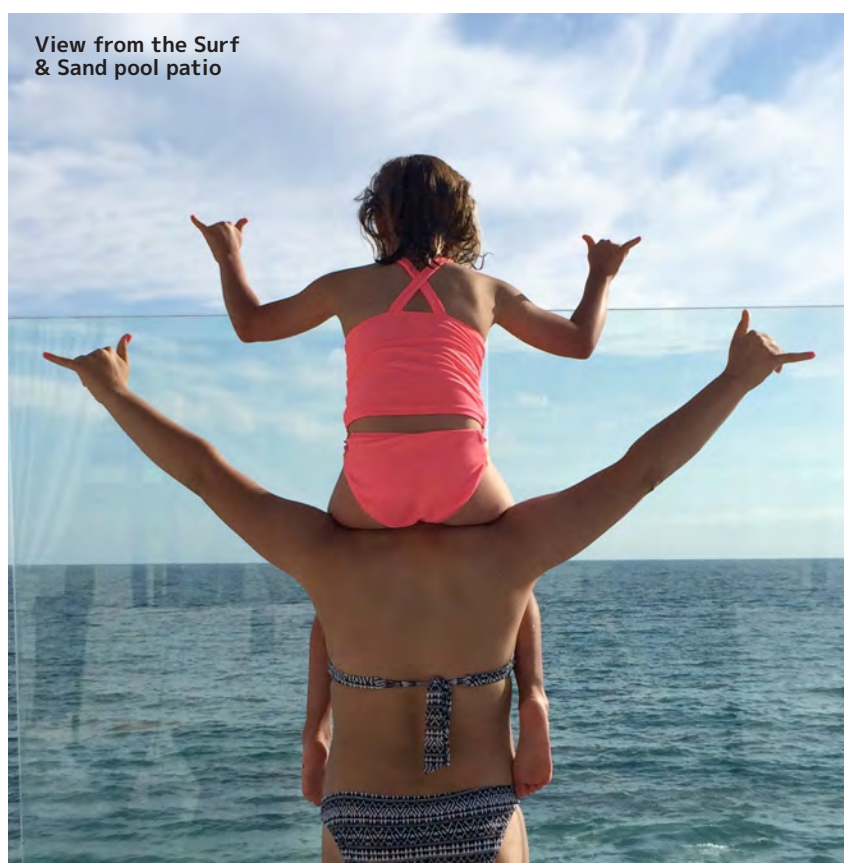
View from the Surf & Sand pool patio

The 15FiftyFive Lounge is also host to the most adorable event on Saturday mornings, Little Picassos. The Surf & Sand staff