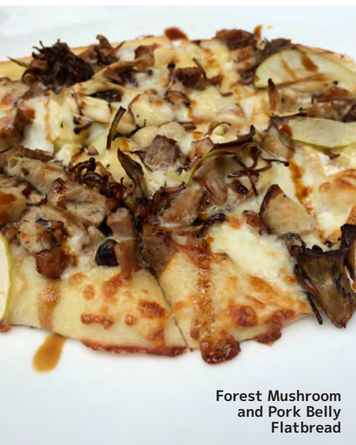
Forest Mushroom and Pork Belly Flatbread

sets out multi-colored framed easels, along with paper and markers. The Lounge area also boasts a picturesque view of the sand and ocean – more than enough inspiration for my little artists.